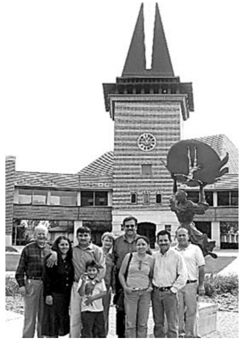
A warm welcome at Warturg College, Waverly, IA