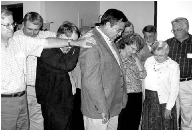
Commissioning Prayers for the Garcias