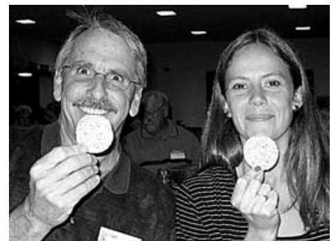
Always Good food & Good Fellowship