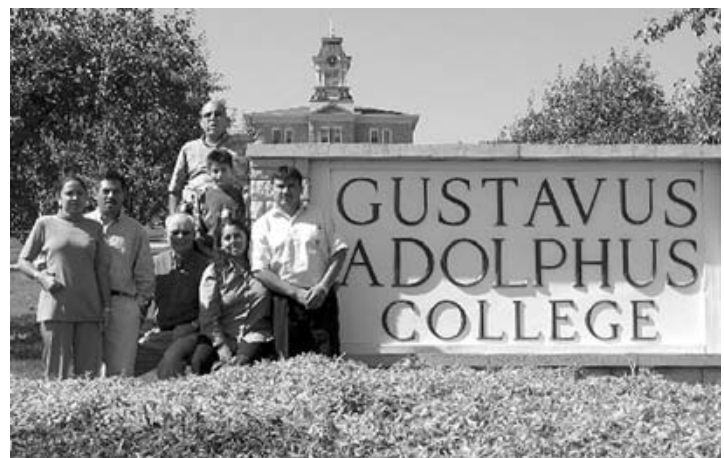
We sing & share at the Gustavus College Chapel—St. Peter, MN