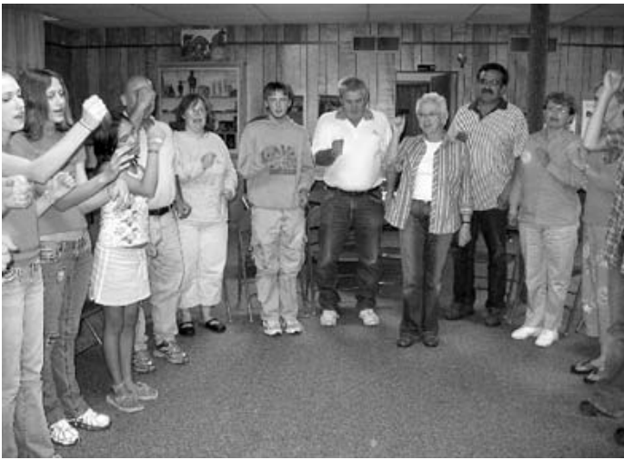
Doing the motions to “Yo Tengo Un Amigo que Me Ama”