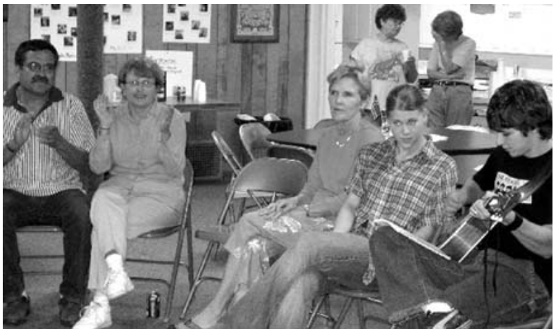
Dakotans and Mexicans sing praise at Roseni Lutheran, Beresford, SD