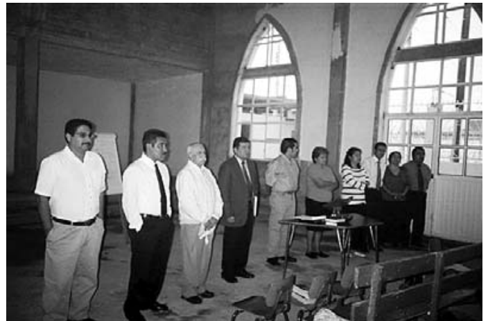
Pastors and presenters teaching extension classes in Saltillo.