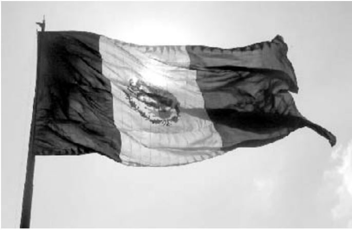
This is the huge flag of Mexico that flies in the park of Nuevo Laredo, Tamaulipas, Mexico. Because of its size it is visible for miles. It is a reminder to pray for the twenty churches of the Evangelical Lutheran Church of Mexico and for the safety and empowerment of the groups that come to bear witness to Jesus on the border and all over Mexico.