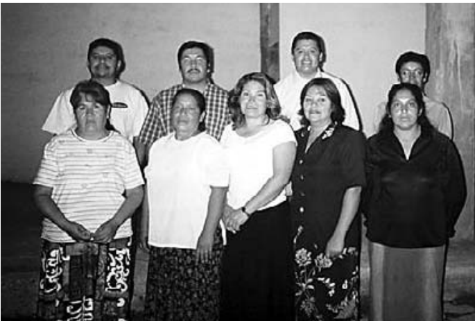
The current group of leaders taking extension classes in Saltillo, Mexico.