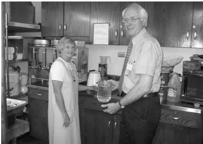
Refreshing the Saints