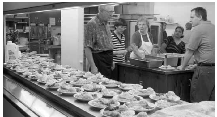
Feeding the 5000