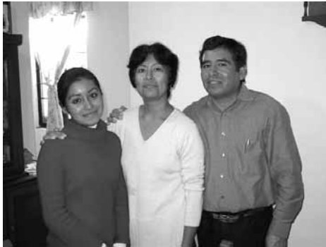
The Bible Institute director and his family.