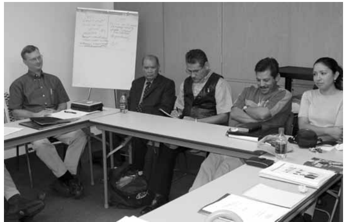
LALM board meets with ELCM pastors