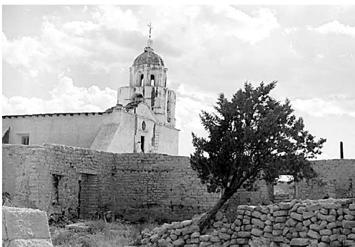
El Potosi Catholic Mission— Picture taken during the October pastors’ conference.