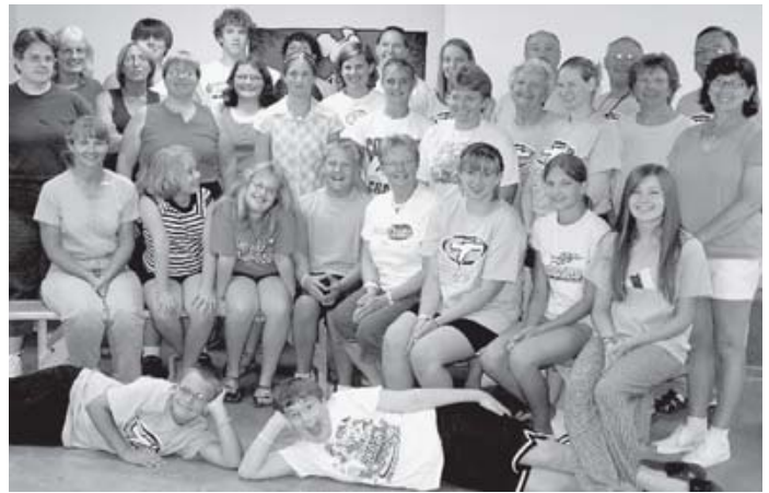
Lands Lutheran – Zumbrota, Minnesota to Aposento Alto – La Boca