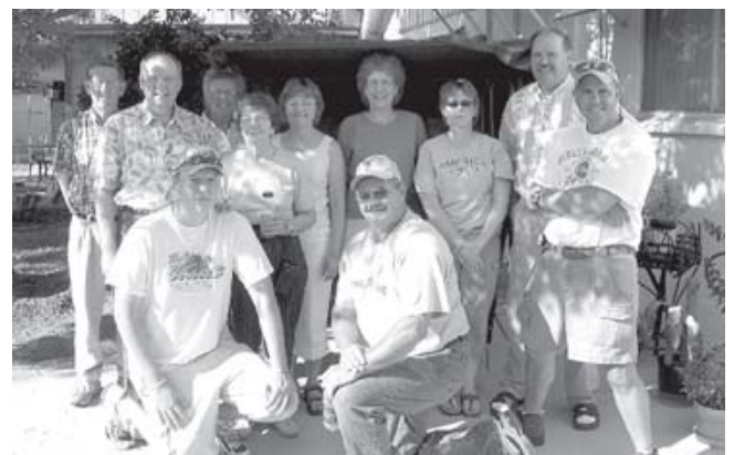
Grace Lutheran - Parker, SD to Bethany-Apodaca