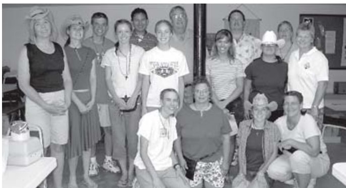
New Hope Lutheran – Osian, Indiana