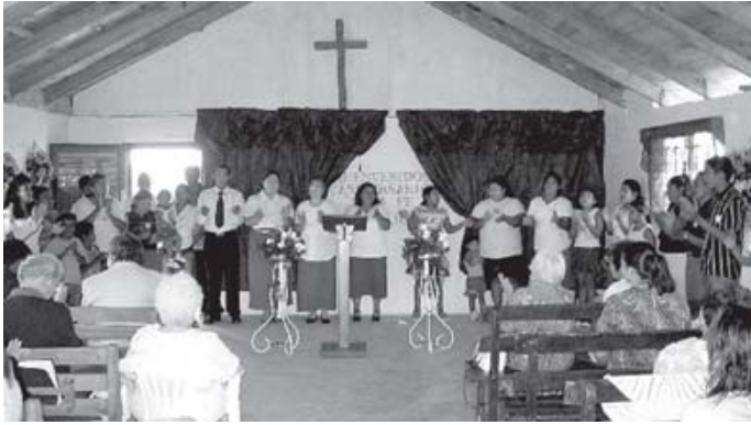
2nd Anniversary service of Faith Alone Congregation

Two years ago there was no Faith Alone Lutheran Church in Nuevo Laredo, but on Wednesday, July 27, 2005 they celebrated in their simple house of worship their second anniversary. Faith Alone is one of the two satellite missions of Calvary