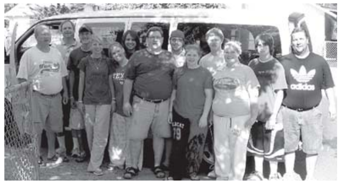
CAN-DO – Dallas, Texas to El Calvario – Nuevo Laredo