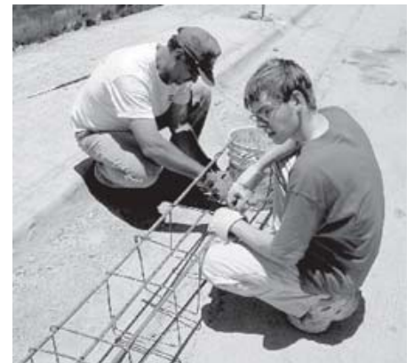
Continued on last page