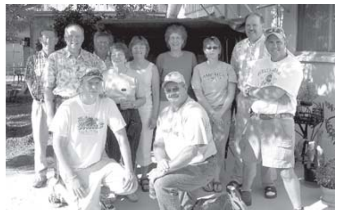
Grace Lutheran - Parker, SD to Bethany-Apodaca