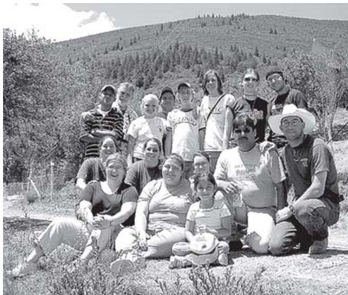
Redeemer – Ft. Worth, Texas to Good Samaritan – Saltillo

Non-Profit Organization U.S. Postage PAID Fergus Falls, MN Permit No. 289