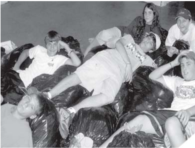
Messiah – Boerne, Texas to Border Station in Laredo, Texas