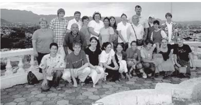
St. Andrews Mission Society (group at left and two workers at right)