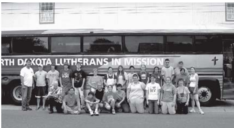
SAMS ND Group to Saltillo