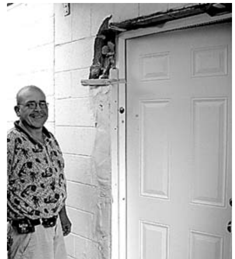
New door for Gospel Bookstore after robbery.

worlds' goods, but the wisdom to exercise a stewardship of protection for what God has entrusted. Thankfully no one was hurt, and no physical damage was done to equipment or to our personal effects. We pray that this story may have a happy ending, but that ending may be only known to the Lord, though we pray for the conviction of sin to come upon the thief so that his real needs can be met in Jesus.