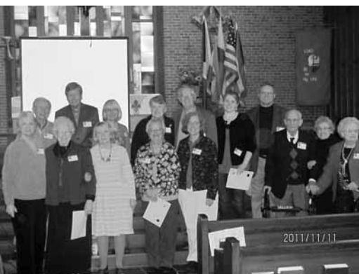
Staff and regular volunteers.