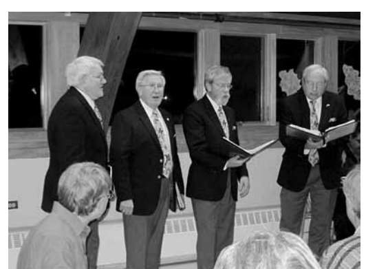
Kinsmen Quartette Friday evening.