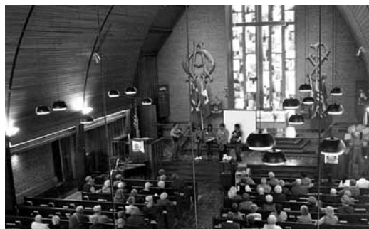
75th Anniversary at Wooddale Lutheran Church