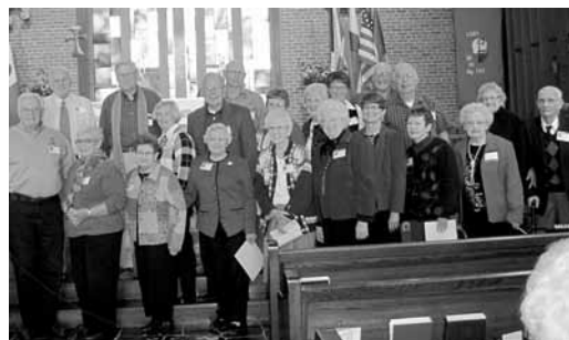
Winter Texans being recognized.

The tone of the conference was 'thank you' as we recognized with certificates of appreciation at every session the many, many volunteers who have blessed the work in Mexico.