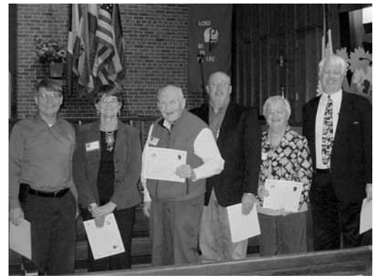
Midwest churches represented.