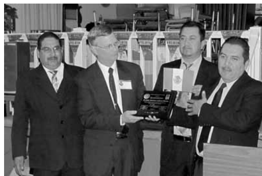
ELCM presents plaque to LALM for 75 Anniversary.