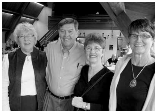
North Dakota Attendees