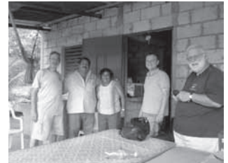
A happy homemaker in front of her new digs.