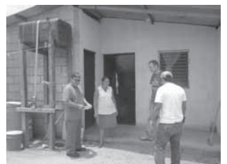
The Lutheran pastor (left) builds his relationship with the new home owner.