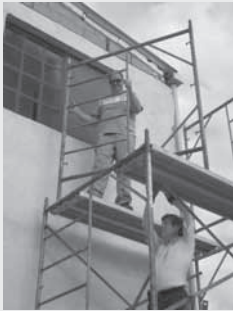
Scaffolding goes up at Philadelphia Lutheran.

In spite of State Department warnings about travel to Mexico, four valiant men from Redeemer of Austin, TX made a short trip to Philadelphia Lutheran in Saltillo, Coahuila Mexico to bring donated items and complete unfinished projects. They installed a hot water heater (they old one had exploded in their face one too many times), laid ceramic tile, installed doors, and had brought in their trailer scaffolding for Mexican workers to complete exterior stucco and weather-proofing. They also took a day to deliver a new pulpit, altar, hot water heater, chairs, and other items to Nazareth Lutheran in Matehuala. It was a brief but memorable visit. God bless the valiant men of Redeemer who completed their mission without incident. (See photos of Louie, Chuck, Dave and Jim.)