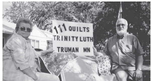
Trinity Lutheran Church, Truman, MN.

Thank you to Roger Ose Ministries for channeling these quilts to the LALM.