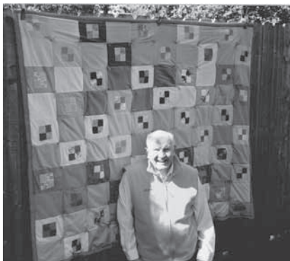
Zion Lutheran Church, Buffalo, MN.

Thank you to Roger Ose Ministries for channeling these quilts to the LALM.