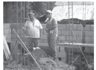
The local site supervisor stands alongside his Mexican counterpart.