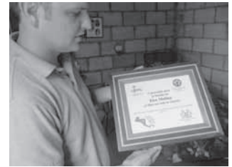
The donation of the home is honored with a plaque.

A Mexican missionary friend from outside the Lutheran church confided in me their decision to begin a similar program. So many have been evangelized over and over but little tangible care for their families and physical needs has been evidenced by the Evangelical community. The witness has been unconvincing to the unbeliever. That's why C.A.L.M.S.' commitment to building 70 % of these homes favoring non-evangelical families, single mothers, etc. has a definite evangelistic purpose. And the local church is involved from start to finish with the family and has the chance to make a meaningful relationship with them in the process. It is also a wonderful way to get the local church to look beyond its walls and consider how to make a difference in their own neighborhood. Pray for us as we move forward with the pilot project in Nuevo Laredo in November.